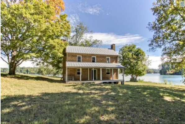
Figure 1- The Bowman House

There has been some recent activity and discussion on a historic property located inside Tellico Village. This property, known as the Bowman Estate, is located in the Tanasi Neighborhood on Tanasi Court.