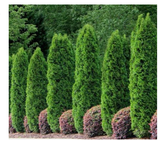
Figure 2 - Emerald Arborvitae

Toqua Golf Course Hole #14 restrooms. Rita Koridek, Toqua Beautification Committee member, recommended these as a privacy screen for homeowners who live behind the restroom building. You can also view them from Walosi Way (look for back of restroom on the lakeside). We are hoping to make this book available in the library.