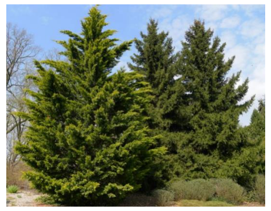
Figure 1 - Leland Cypress

Are you looking for ideas for plants for your yard? This book can be a good resource. The author combines native with non-native suggestions, shows you a photo, explains why it is better than another similar plant. Here is an